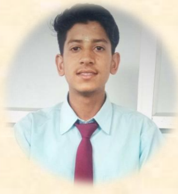
2 nd Ayush(BBA 3 rd 2023) (HPU) SGPA(8.00)