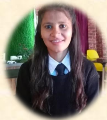
3 rd Shikha (BCA 3 rd 2023) (HPU) SGPA(8.17)

Note: The applicants are advised to visit the college website regularly for the latest information.