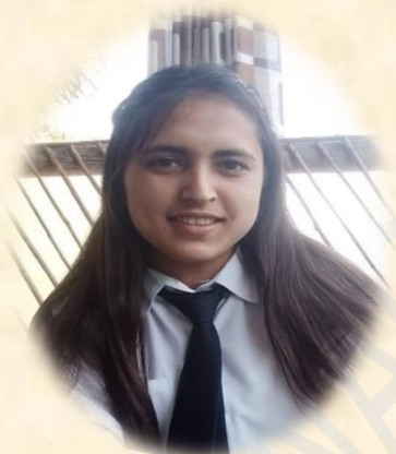
1 st Sargam (BCA 3 rd 2023) (HPU) SGPA(8.63)